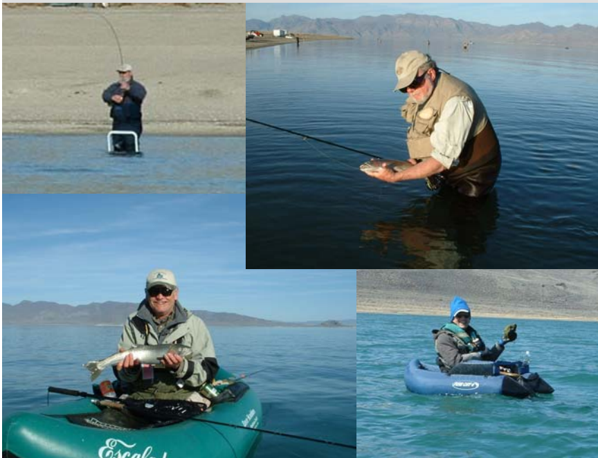
March Fishout at Pyramid Lake