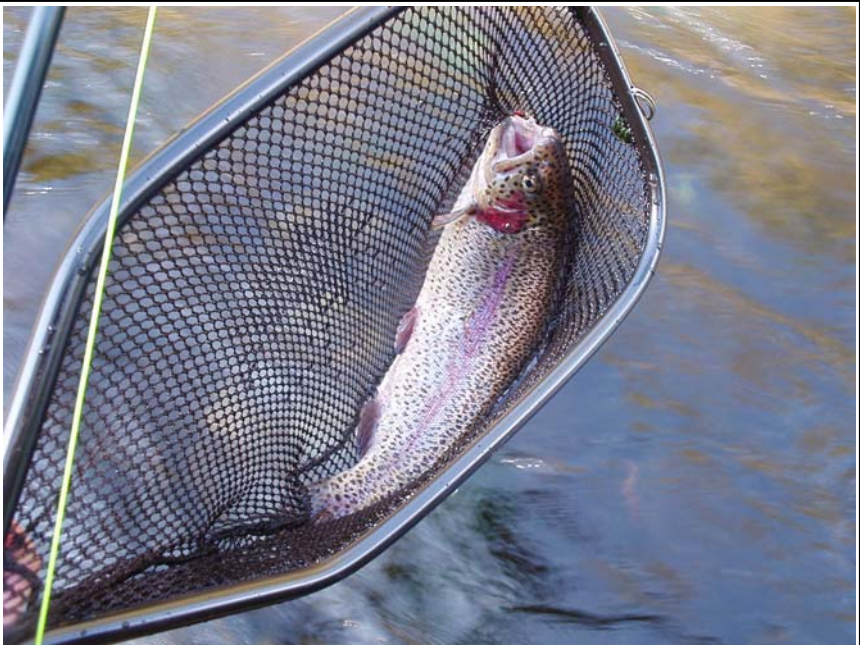
Another beautiful Upper Sac Trout